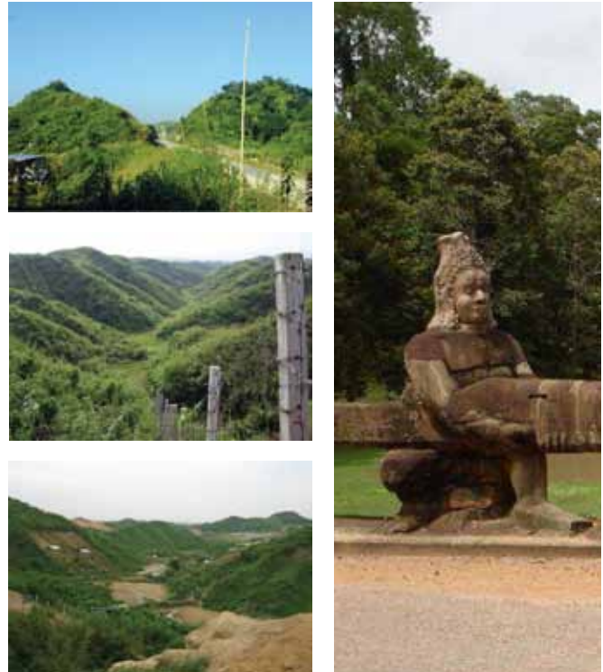
SITE LOCATION PHOTOS