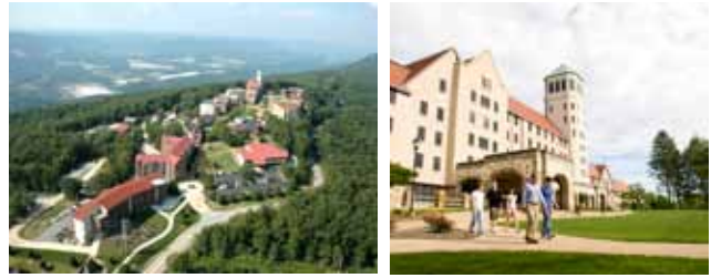
AERIAL VIEW / CARTER HALL

The College has hired an engineer to design the relocation of Scenic Highway and to provide data for discussions with the State — which to date have been positive. Once the road is relocated, the College intends to develop the Fine and Performing Arts Center. Covenant is also moving forward with a major renovation of their signature building, Carter Hall, as well as the construction of additional student housing.