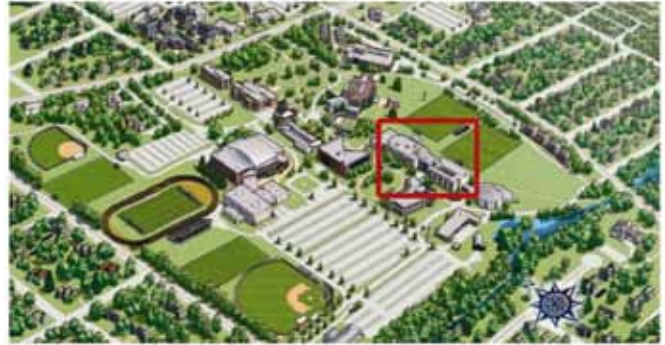
MONMOUTH UNIVERSITY CAMPUS WITH SCIENCE FACILITIES HIGHLIGHTED

Monmouth University School of Science Strategic Plan 2010-2015 includes a vision to continue to enhance academic programs and curricula, grow enrollment, and create science facilities that promote a STEM (science, technology, engineering, and mathematics) education. The School includes four departments: Biology, Chemistry/Medical Technology/Physics, Computer Science & Software Engineering, and Mathematics. In addition, there are two Centers of Distinction: Rapid Response Institute and the Urban Coast Institute. DOBER LIDSKY MATHEY (DLM) worked with the University science and engineering faculty to develop a program that describes the facilities needed to support the revitalized pedagogy.