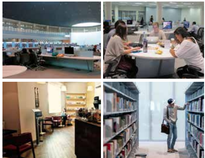
LIBRARY PHOTOS