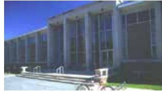
GRIFFITHS ART CENTER

As part of a long-term improvement plan, St. Lawrence University constructed a new Student Center to replace the existing Noble Center. DOBER LIDSKY MATHEY (DLM) was retained to help the University determine how vacated space in Noble could be reused. Departments under study — Fine Arts, Music, and Speech and Theater — were located in Griffiths Arts Center, attached to Noble, as well as in two small buildings on campus. The goal was to consolidate and expand space for the arts, and the Brush Gallery, which is also in this complex.