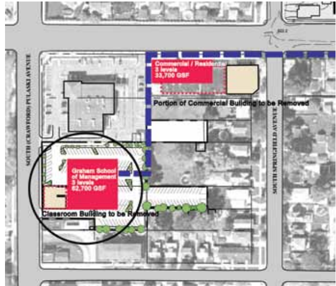
CAMPUS PLAN SITE LOCATION