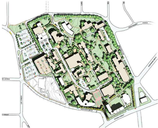
ILLUSTRATIVE CAMPUS PLAN 2000