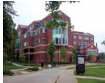
Camille Olivia Hanks Cosby Academic Center

An architect has been selected and the project is currently in early stages of design.