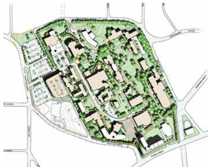
Illustrative Drawing: Campus Master Plan