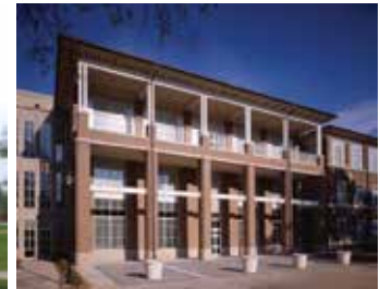
Albro-Falconer-Manley Science Center