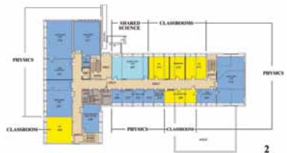
McCOOK HALL - SCHEME 1 - SECOND FLOOR