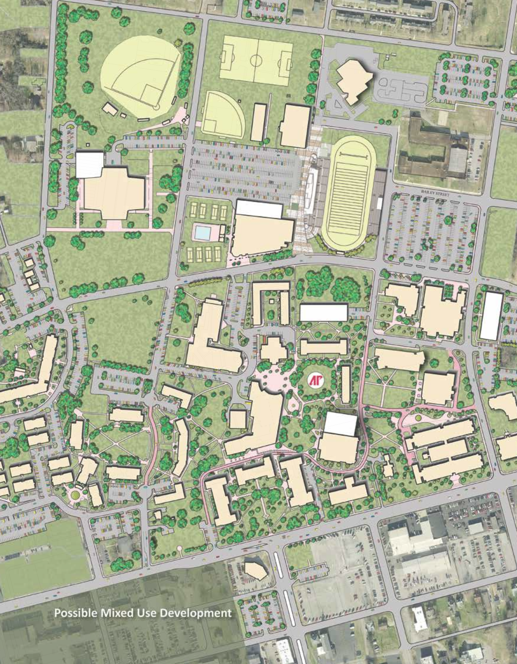
Possible Mixed Use Development